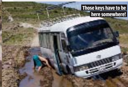
Those keys have to be here somewhere!

In terms of clothing, make sure to pack lots of layering options: high mountain weather is notoriously fickle, and warm sunny days can quickly turn cool and nasty. Also don’t be afraid to bring body armour – lightweight knee and elbow pads are well worth the extra weight if you do make an unscheduled dismount.