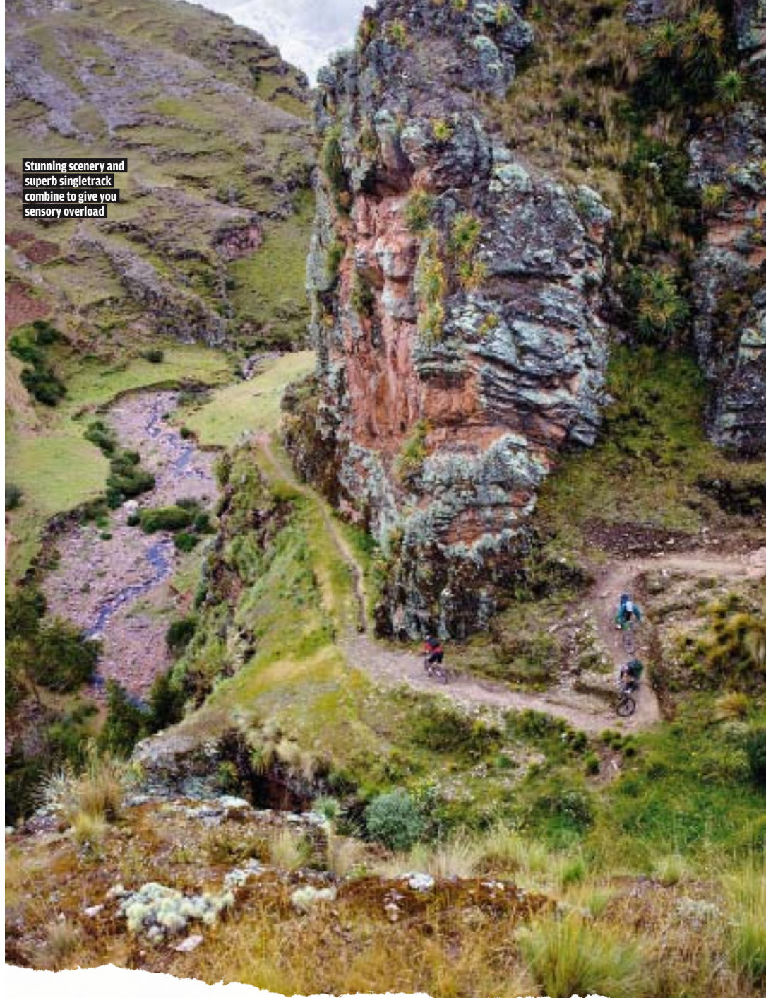
Stunning scenery and superb singletrack combine to give you sensory overload

Indeed, venturing into rural Peru is like travelling back in time. Life here hasn't changed much since the days of the Inca Empire, which started in the Peruvian highlands in the early 13th century. Many inhabitants still subsist hand to mouth, cultivating small patches of crops and rearing farm animals to