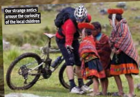
Our strange antics arouse the curiosity of the local children