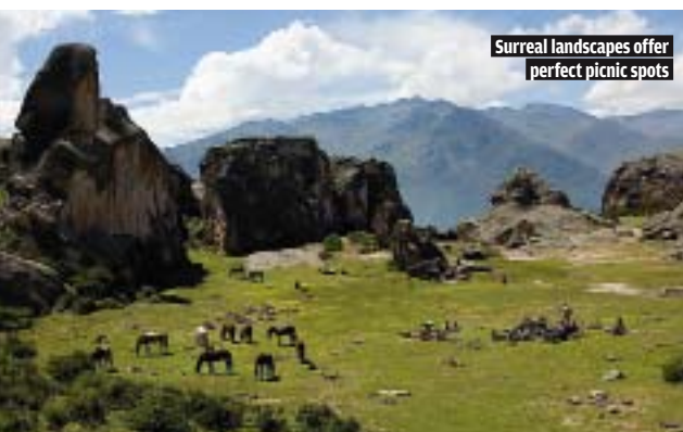
Surreal landscapes offer perfect picnic spots

No wonder then that Stein picks up most of his spare parts during occasional visits to the US, or asks