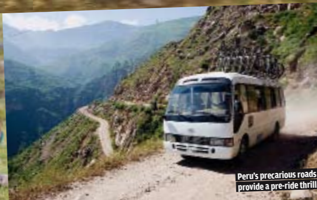
Peru's precarious roads provide a pre-ride thrill