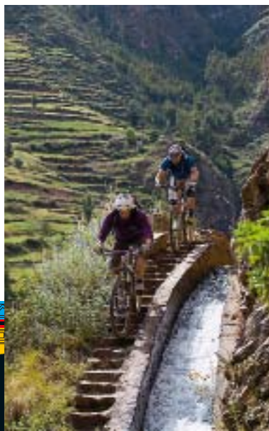
Below: The setting off spot - and not a cafe or bike wash in sight...