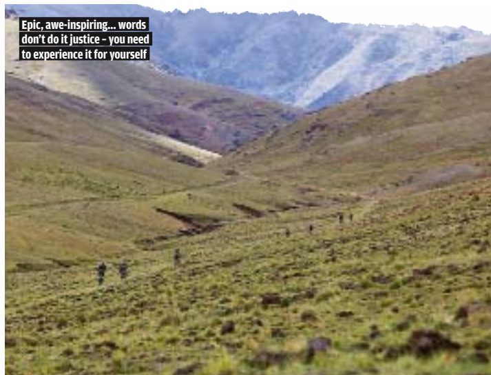
Epic, awe-inspiring... words don't do it justice - you need to experience it for yourself