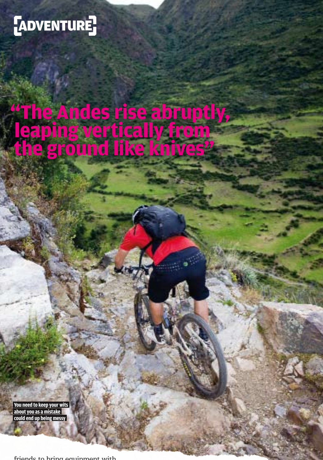
You need to keep your wits about you as a mistake could end up being messy

“The Andes rise abruptly, leaping vertically from the ground like knives”